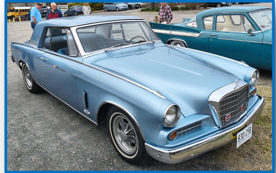
Jim Jett's 1963 Gran Turismo Hawk R-1